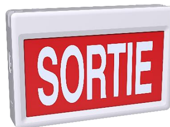
Special French Pictogram