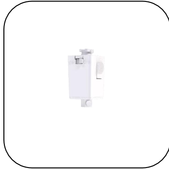
PENDANT LUMINAIRE ADAPTER, CORD