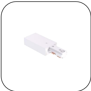
Top Access End Feed