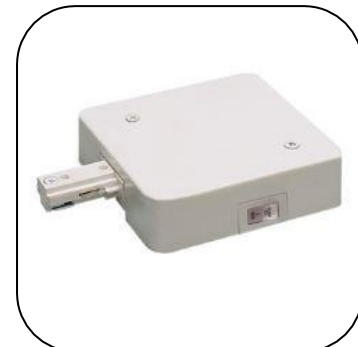
Single Circuit End Feed