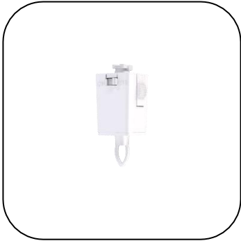
PENDANT LUMINAIRE ADAPTER, CHAIN