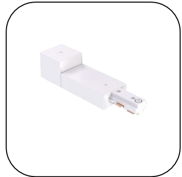
CONDUIT END FEED