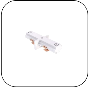
MINI I CONNECTOR