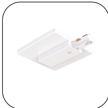
END FEED KIT + COVER