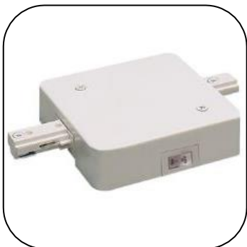
Single Circuit In-Line Feed